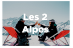
Les 2 Alpes