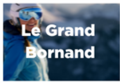
Le Grand Bornand