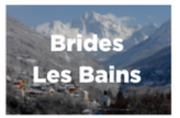
Brides Les Bains